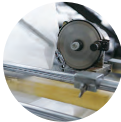
Automatic Cloth Cutting System