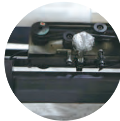
Roller Speed Adjustment Device