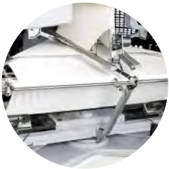
Open Width Fabric Take Down System